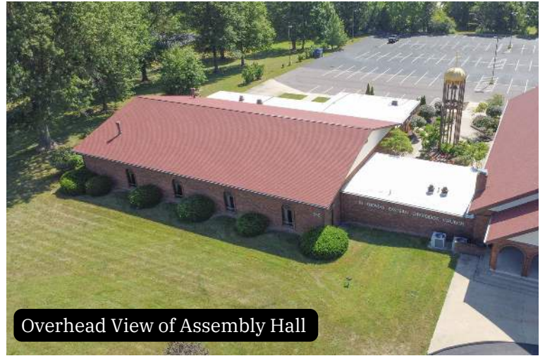
Overhead View of Assembly Hall