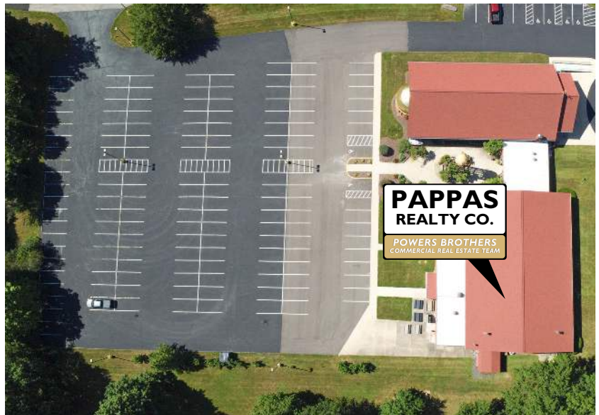
The information contained herein is from sources deemed reliable but no guarantee is made herein. Confirm all data through independent sources

Located on the east side of S Cleveland Massillon Rd with access from the new roundabout right off of Rt.77 and connected to St. Thomas Eastern Orthodox church. Excellent opportunity for schools & community organizations looking for an open floor plan with fully equipped kitchen.