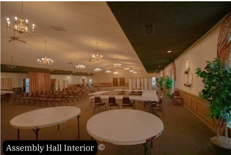
Assembly Hall Interior