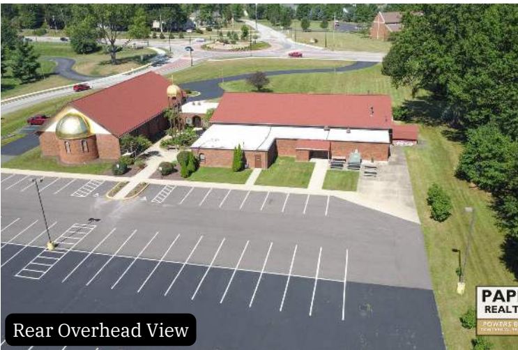
Rear Overhead View