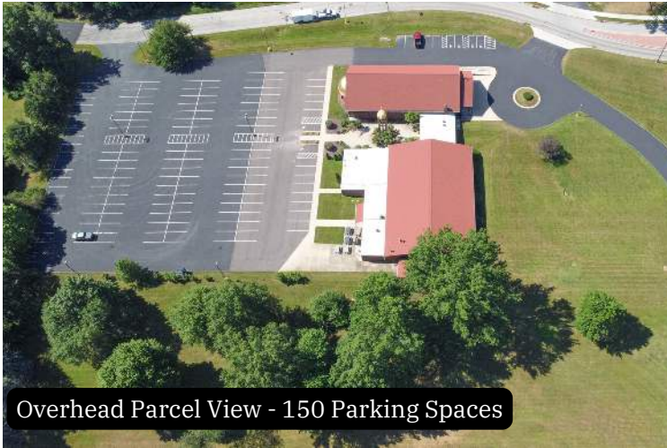
Overhead Parcel View - 150 Parking Spaces