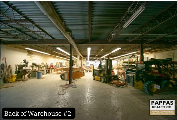
Back of Warehouse #2