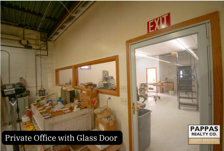
Private Office with Glass Door