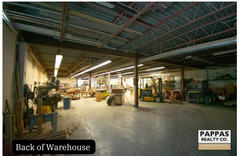
Back of Warehouse