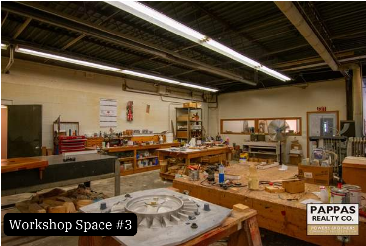
Workshop Space #3

PAPPAS REALTY CO. POWERS BROTHERS COMMERCIAL REAL ESTATE TEAM