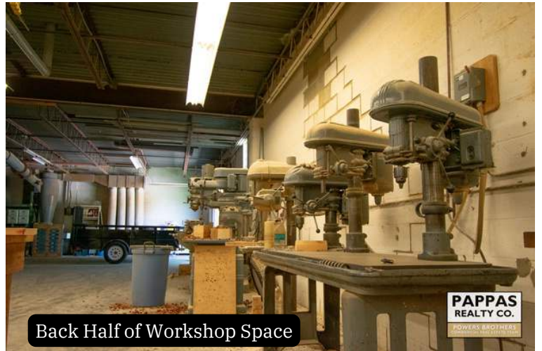
Back Half of Workshop Space

PAPPAS REALTY CO. POWERS BROTHERS COMMERCIAL REAL ESTATE TEAM