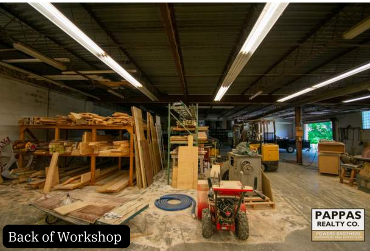
Back of Workshop