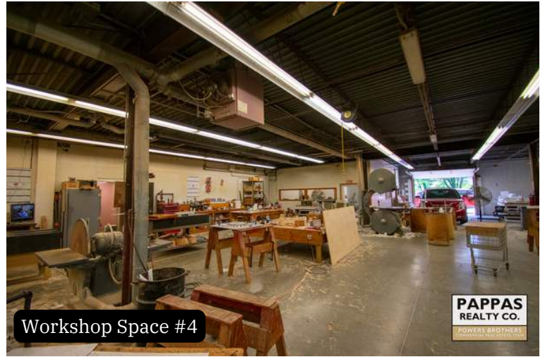
Workshop Space #4

PAPPAS REALTY CO. POWERS BROTHERS COMMERCIAL REAL ESTATE TEAM