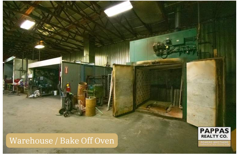
Warehouse / Bake Off Oven

PAPPAS REALTY CO. POWERS BROTHERS COMMERCIAL REAL ESTATE TEAM