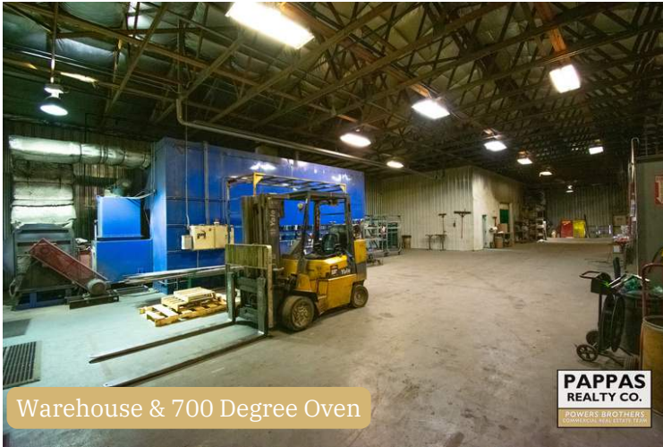
Warehouse & 700 Degree Oven

PAPPAS REALTY CO. POWERS BROTHERS COMMERCIAL REAL ESTATE TEAM