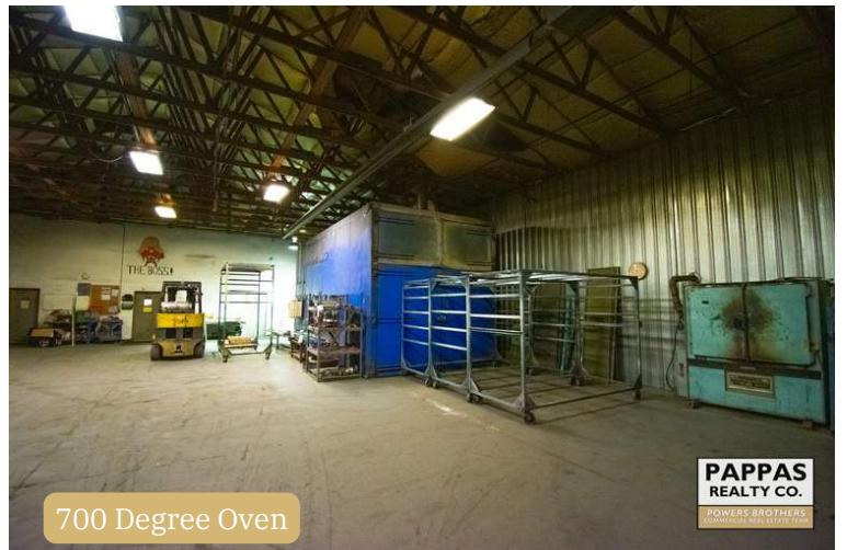
700 Degree Oven

PAPPAS REALTY CO. POWERS BROTHERS COMMERCIAL REAL ESTATE TEAM