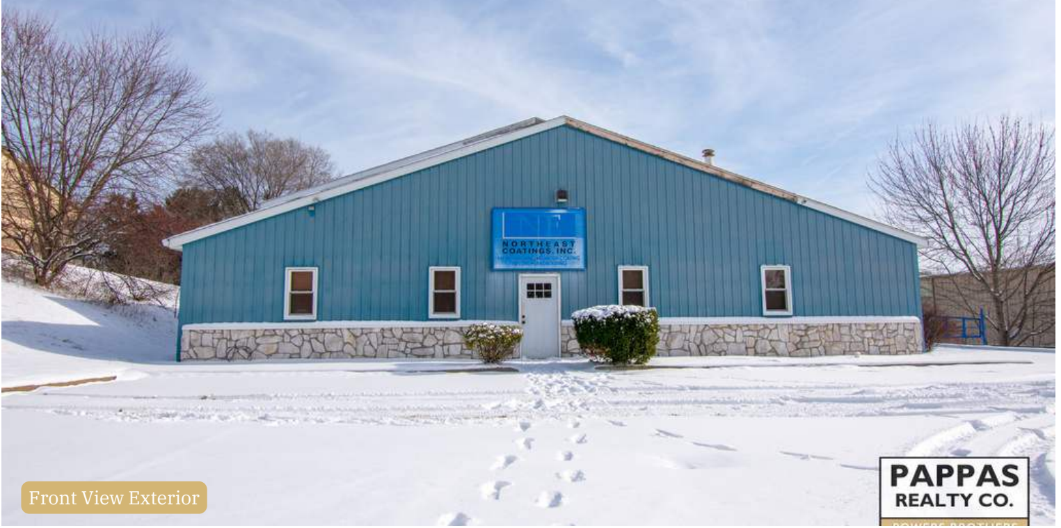
Front View Exterior