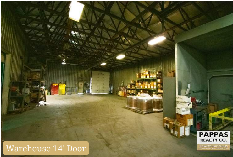
Warehouse 14' Door

PAPPAS REALTY CO. POWERS BROTHERS COMMERCIAL REAL ESTATE TEAM