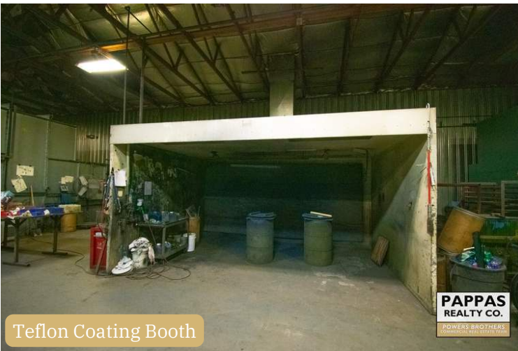
Teflon Coating Booth

PAPPAS REALTY CO. POWERS BROTHERS COMMERCIAL REAL ESTATE TEAM