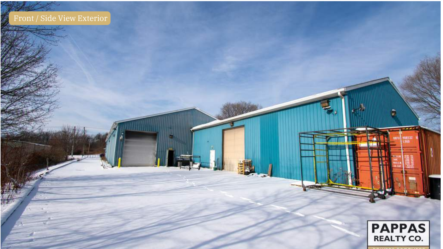
Front / Side View Exterior