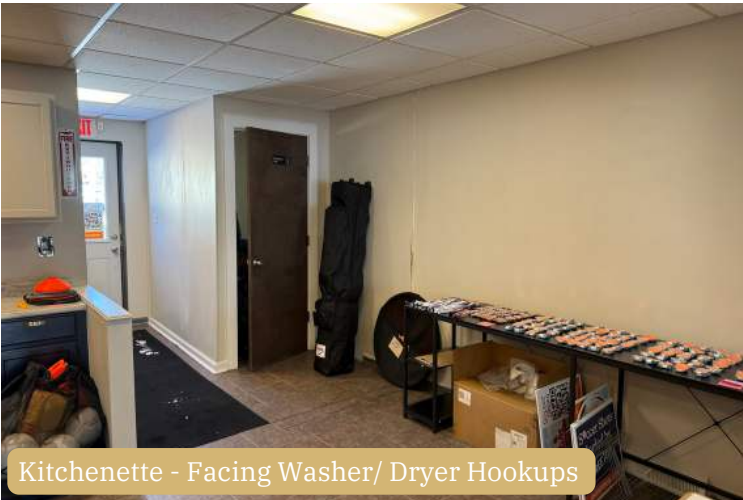
Kitchenette - Facing Washer/ Dryer Hookups