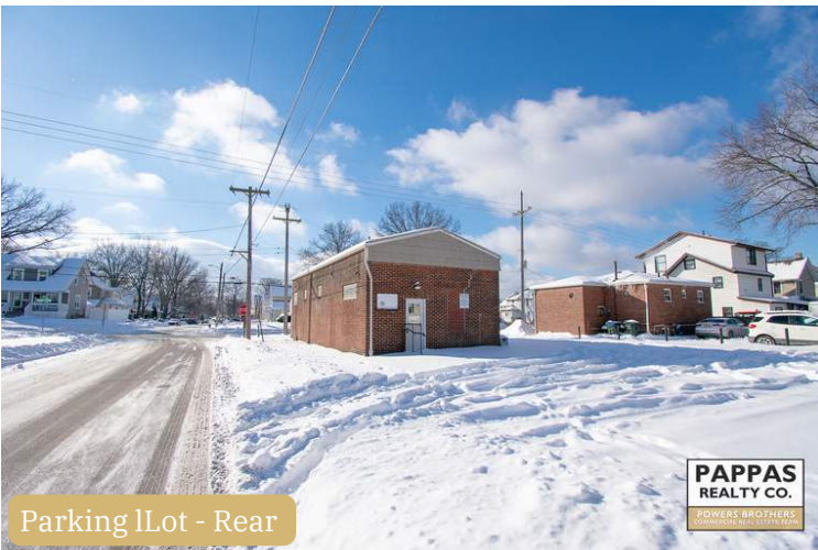
Parking Lot - Rear