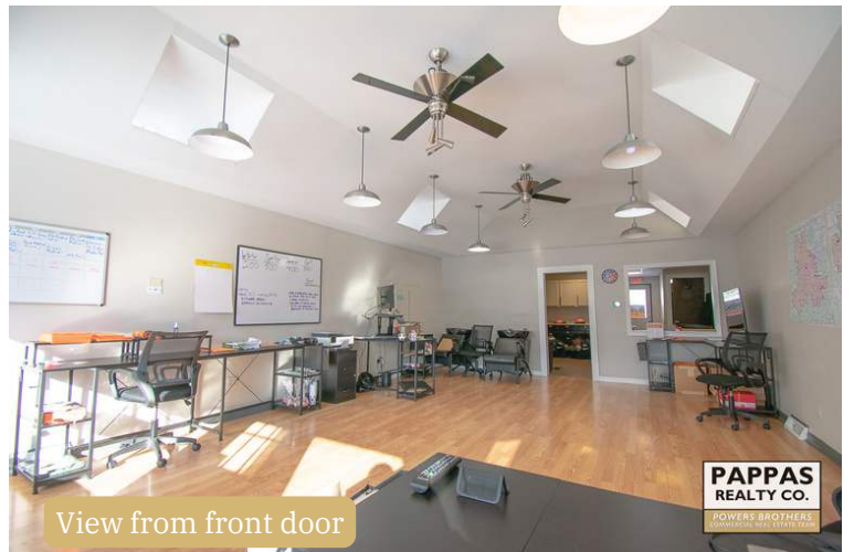
View from front door