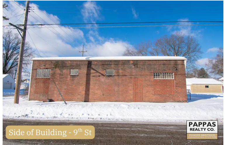
Side of Building - 9 th St