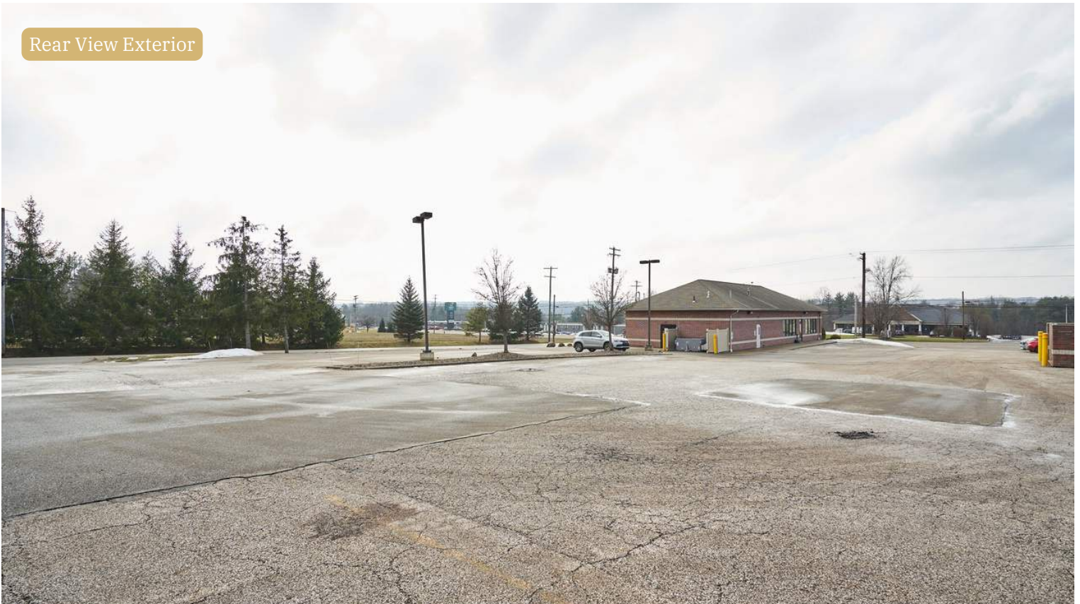
Rear View Exterior