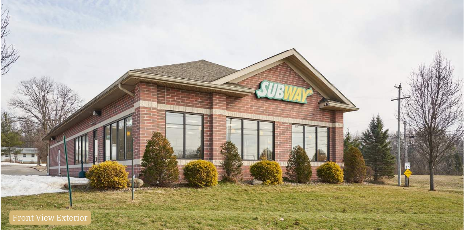
Front View Exterior