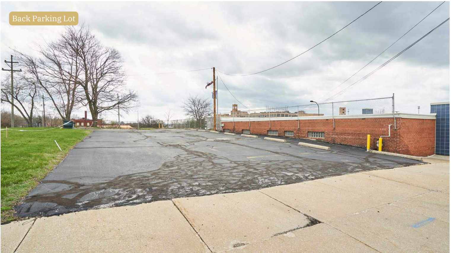
Back Parking Lot