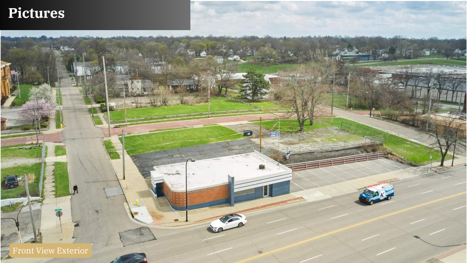
Front View Exterior