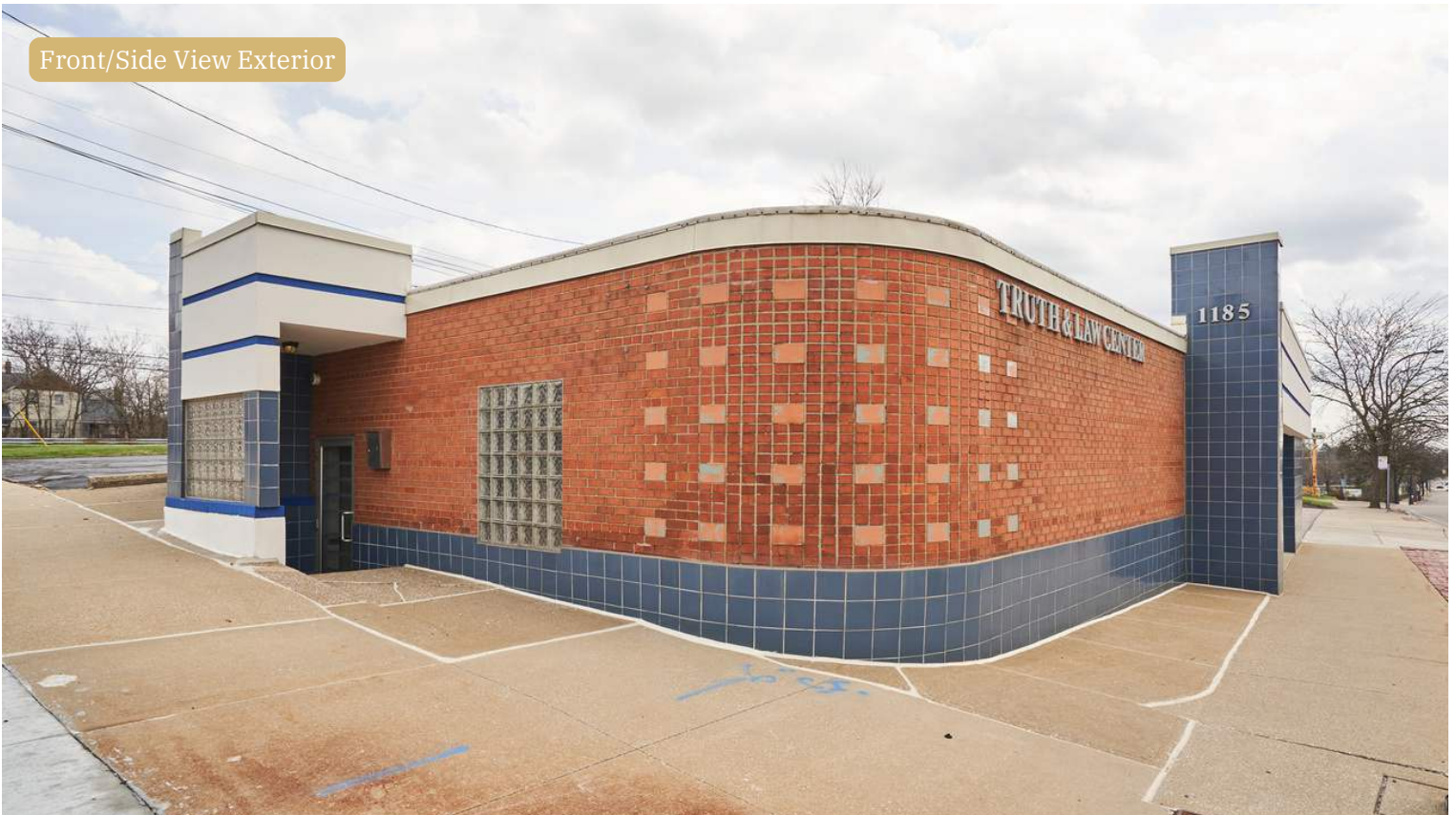
Front/Side View Exterior