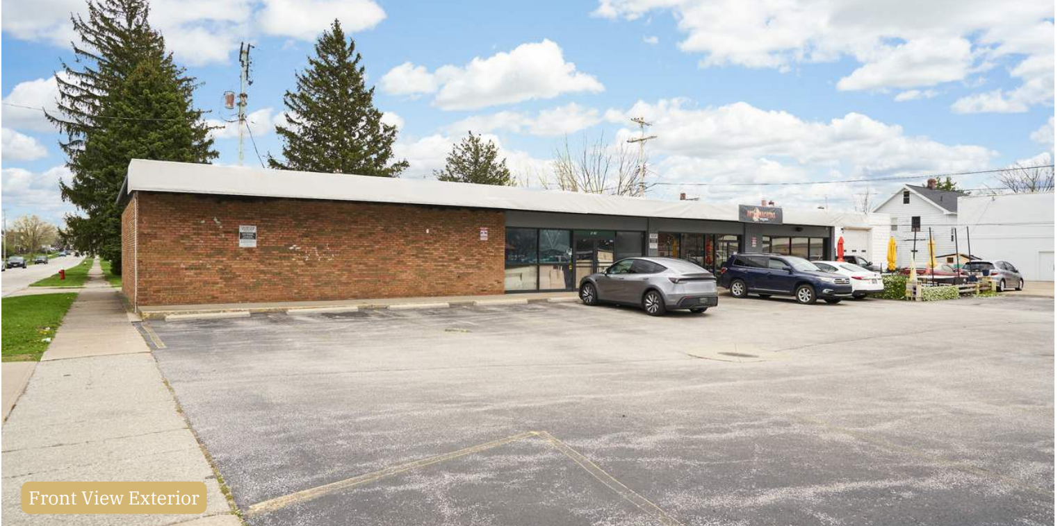
Front View Exterior