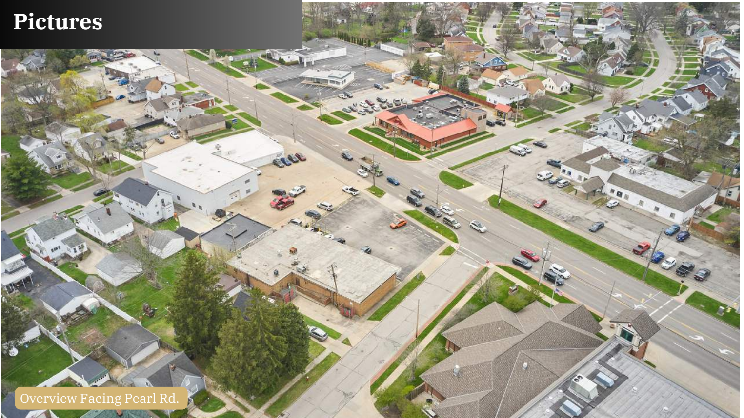
Overview Facing Pearl Rd.