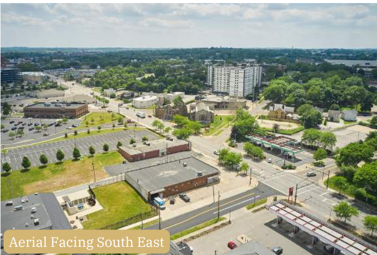
Aerial Facing South East