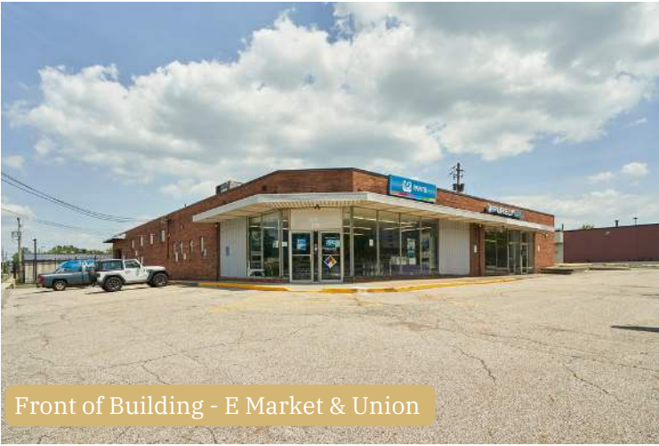
Front of Building - E Market & Union