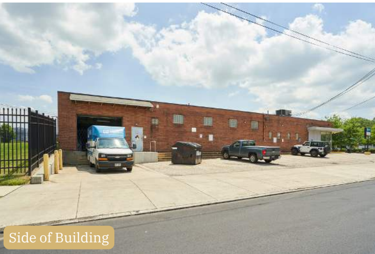
Side of Building