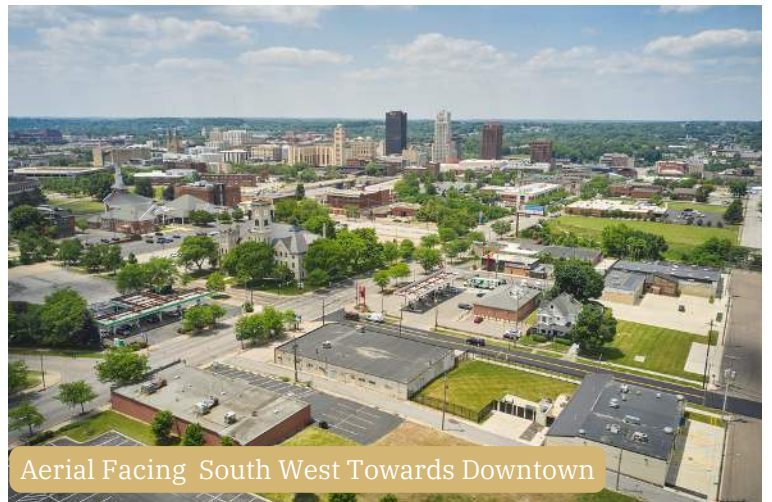
Aerial Facing South West Towards Downtown