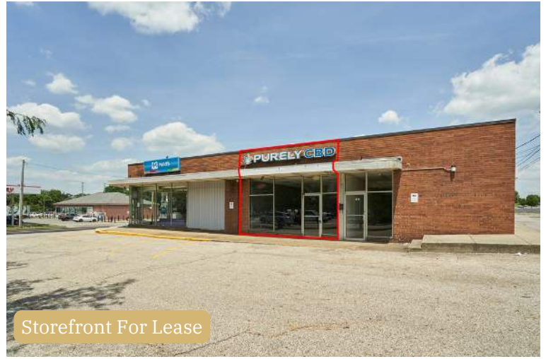
Storefront For Lease