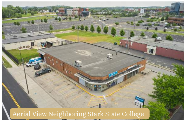
Aerial View Neighboring Stark State College